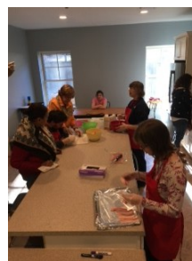
Teamwork on display!