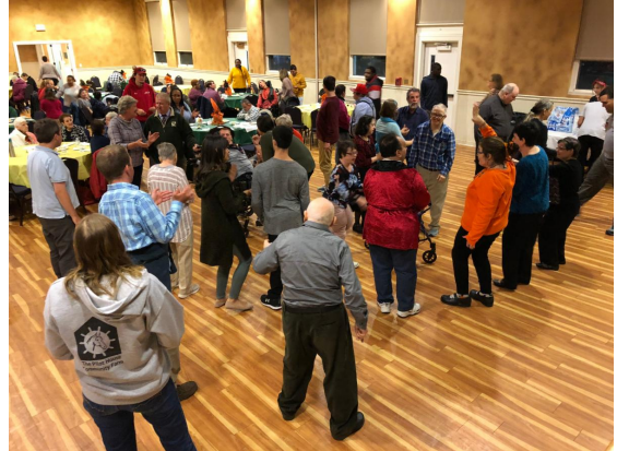
The dance floor was filled at our Fall Fling Dance in October. <u>See photos.</u>