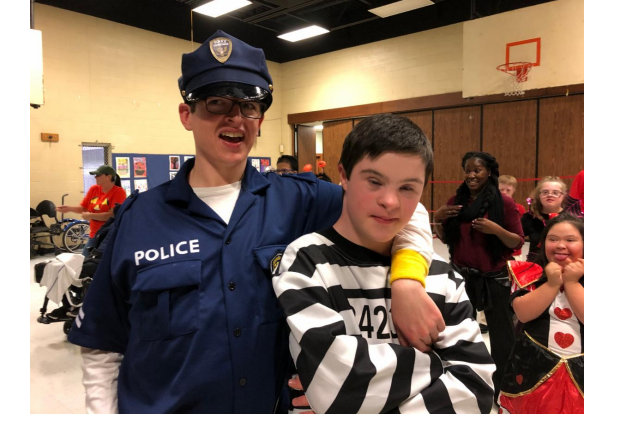
Halloween inspired some creative costumes and was lots of fun. <u>See Adult Program photos</u>. <u>See Academy photos</u>.